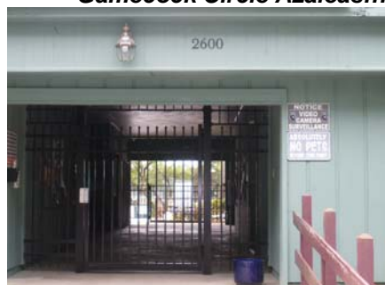
Clubhouse now has address of 2600 Little River Drive