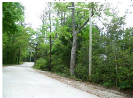
New light on road to Compound (another is at end of Swamp Fox)