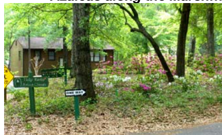
Gamecock Circle Azaleas...