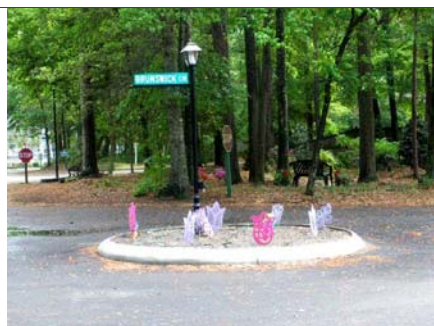
The new lamp posts and circle islands are in and will soon be filled with color!!