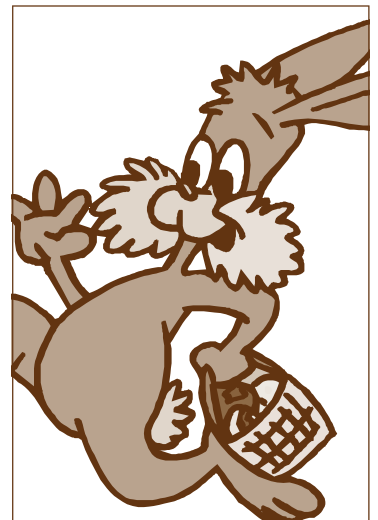
Gotta Run, see ya soon!